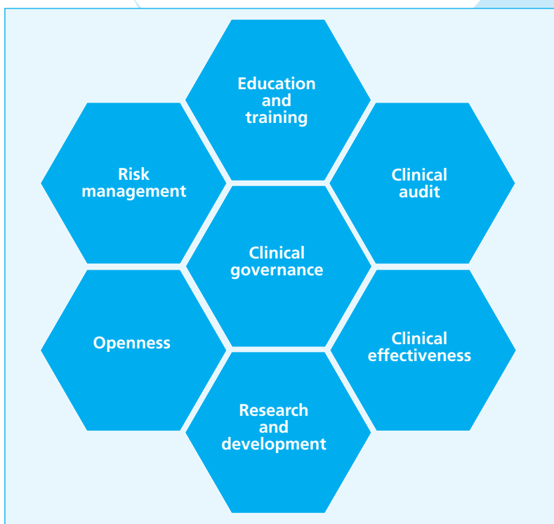
Figure 1. The elements of clinical governance